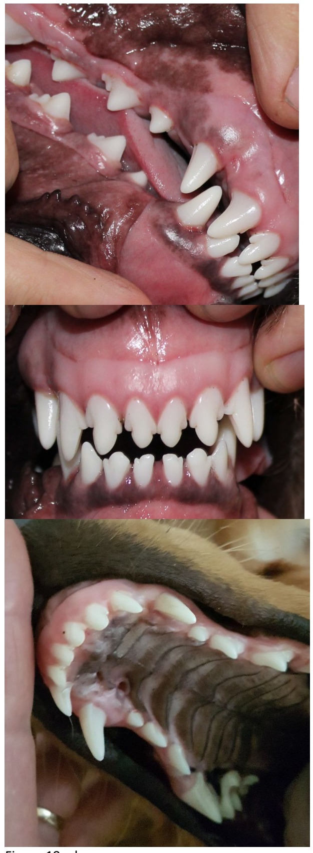
Figure 19a, b, c

Keeping these guidelines in mind will help me to help you, your patient and your client with a maximum of efficiency.