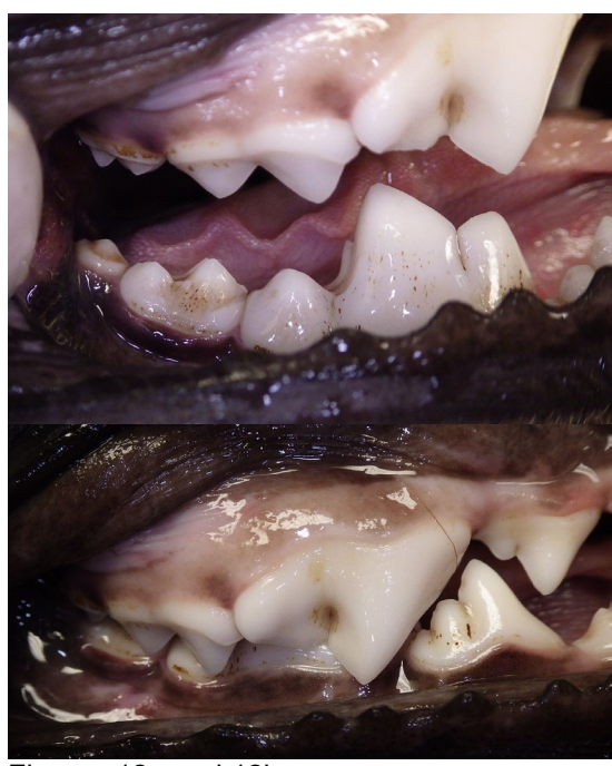
Figures 12a and 12b

malocclusion should ever be No considered normal, regardless of the breeds. some where malocclusions are selected for, they are "Abnormal in accordance with current breed standards." As advocates for animal health and welfare, we should all be campaigning to get these standards changed. Every animal deserves a comfortable and functional mouth. There is no logical, moral or medical justification for purposely producing animals with deformities that have a negative impact on their quality of life.